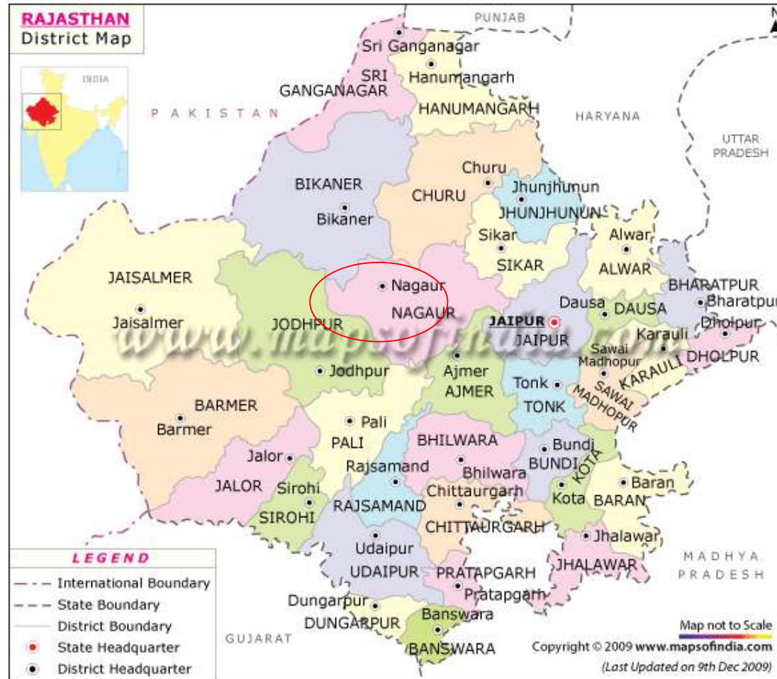
Annexure 1: Location map of Nagaur