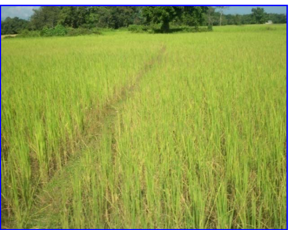
Local long duration varieties (130-140 days)