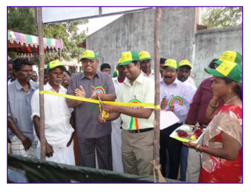
District collector launching the workshop & inaugurating vermi unit